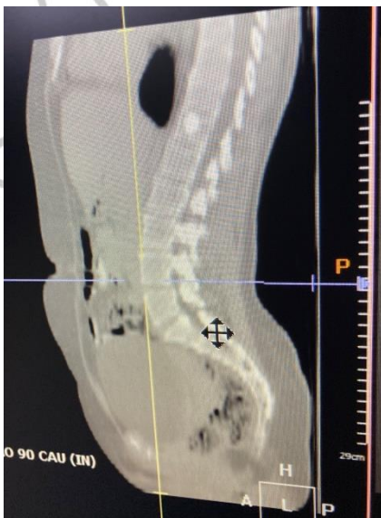
Figure1: Spinal bone metastasis