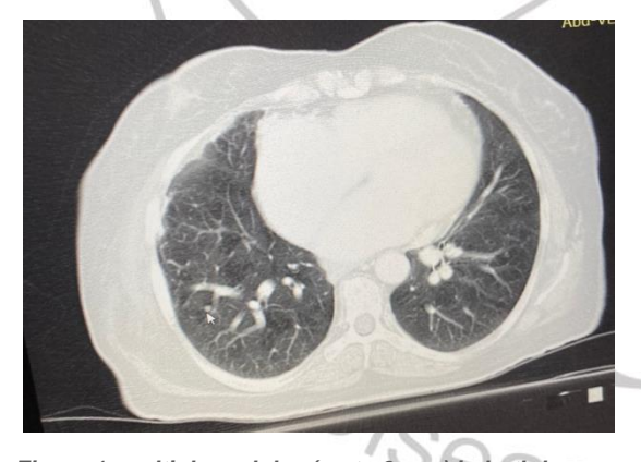
Figure 1, multiple nodules (up to 6 mm) in both lungs