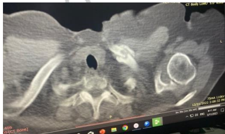
Figure 1: CT scan of chest, left clavicle lesion, before neoadjuvant chemotherapy.