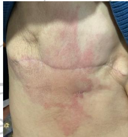
Figure 2: Erythematous patch in mastectomy bed