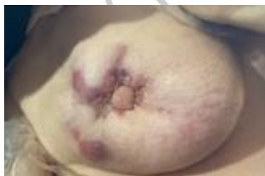
Figure1: Breast exam