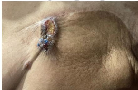
Figure 1: Ulcer in the mastectomy bed