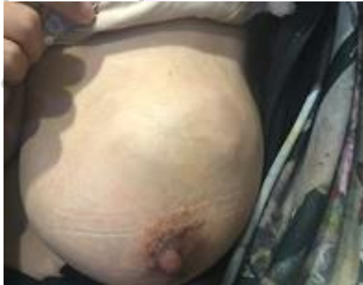
Patient's left breast mass.