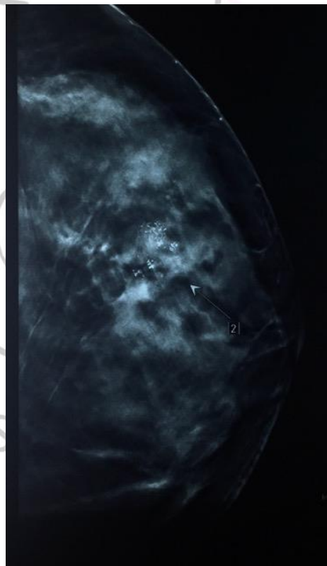
Mammography shows diffuse micro-calcification; DCIS

Recommended Plan: evaluation of first and second pathology, if sum of tumor sizes is more than 1cm then adjuvant chemotherapy is recommended